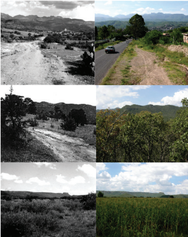
Figure 3. Selected original and recent landscape photographs. They correspond to Site 1 El Tigre (top), Site 5 Sierra Fría (middle), and Site 13 Los Caños (bottom). Recurrent issues in these and other photographs are evident: growth of populated places, replacement of natural vegetation by agricultural fields, appearance of roads and urban vegetation (top and bottom), and the recovery of the oak forests in Sierra Fría (middle).