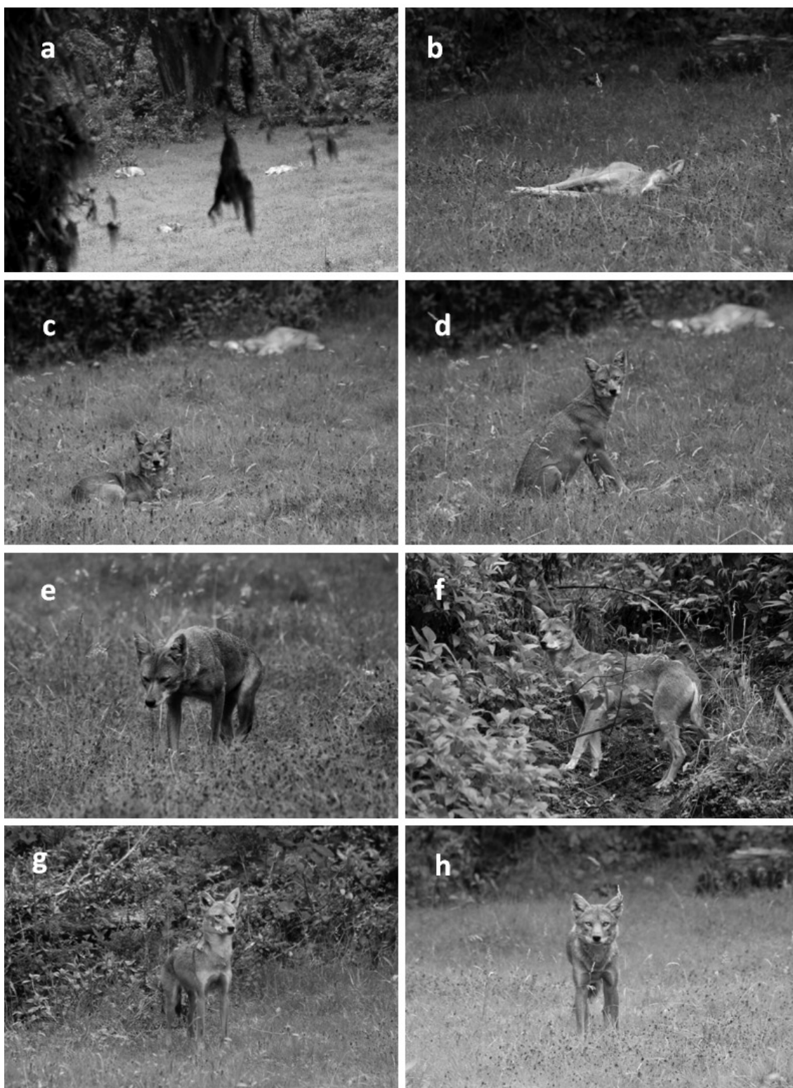
Figure 1. a, coyotes lying a few meters from one another. b, a coyote sleeping. c, a coyote who has just awoken. d, a coyote sitting. e, a coyote slowly approaching the photographer. f, a coyote stopped at the edge of the pasture and looking at the photographer. g, detail of the second coyote looking at the photographer. h, detail of the third coyote looking at the photographer.