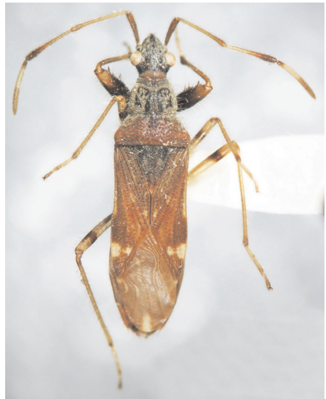
Figure 1. Myodacanthus trinidadensis sp. nov.

Diagnosis. Antenna elongate, pedicel long, longer than basiflagellomere, that is slightly widening towards apex; antenniferous tubercles slightly divergent in dorsal view; and pygophore (Figs. 2a-d) with a characteristic shape in dorsal view, with a rounded protuberance distally.