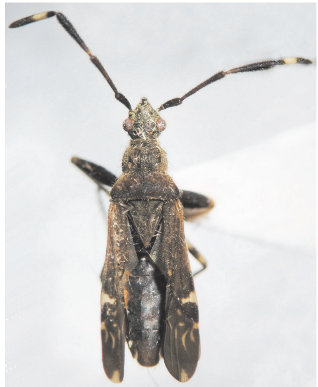
Figure 3. Myodacanthus williamsi sp. nov.

Diagnosis. Antennae with a relatively short pedicel, shorter than distiflagellomere; basiflagellomere widening towards apex; antenniferous tubercles parallel in dorsal view; and pygophore (Figs. 4a-d) subtriangular in dorsal view, produced posteriorly.