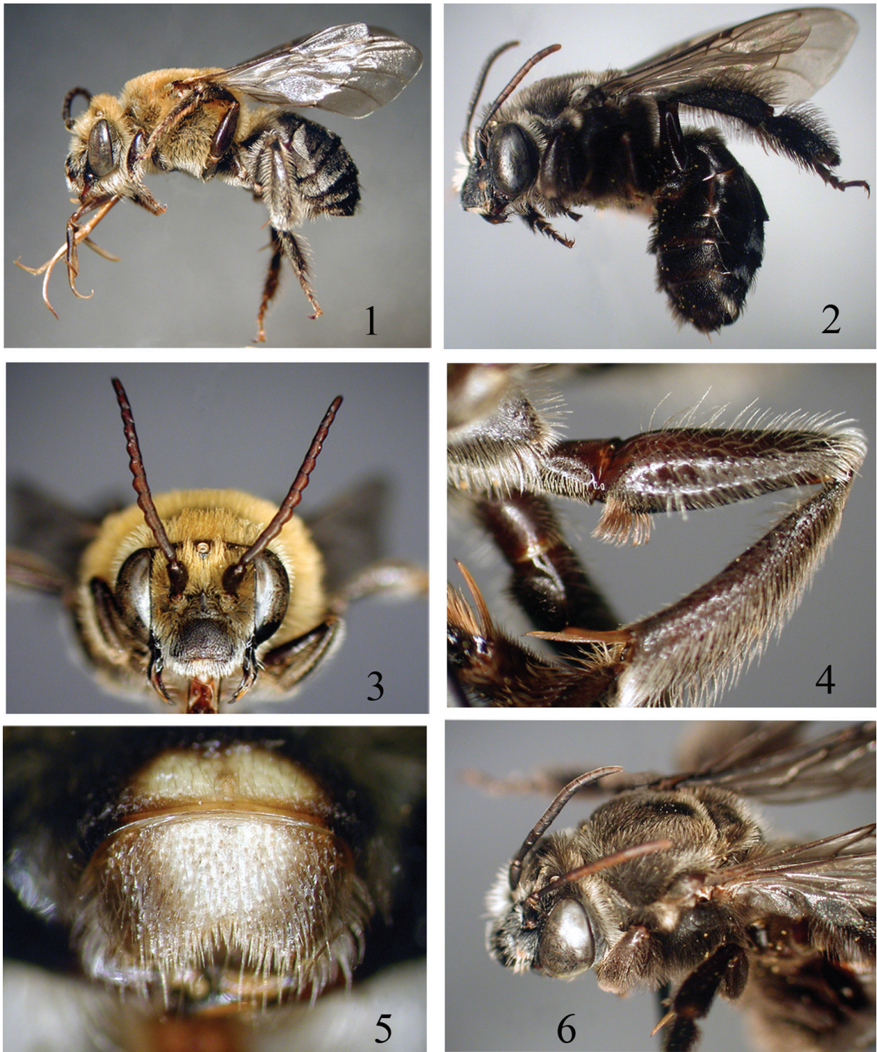
Figures 1-6. Peponapis pacifica sp. n. 1, male in lateral view; 2, female in lateral view; 3, frontal view of male, showing crenulate antennae; 4, hind leg of male, showing tuft of setose hairs on femur basoventrally; 5, labrum of female with concave distal margin and yellow maculation, and 6, dorsal view of mesosoma of female.