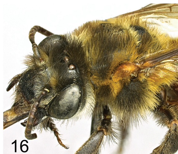
Figures 11-16. Peponapis parkeri sp. n. 11, male in lateral view; 12, female in lateral view; 13, frontal view of male; 14, hind leg of male; 15, T1 of the female; 16, dorsal view of mesosoma of female.