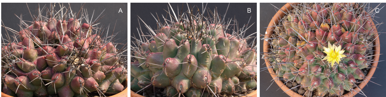
Figure 2. Thelocactus conothelos ssp. flavus in cultivation. A), the south facing side of the plant showing a deep red colouration of the stem as a result of betacyanin accumulation in response to high irradiation. B), the north facing side of the same plant that is greener in colour due to the less exposure to the sun. C), top view of the specimen. The difference in pigmentation between south and north facing sides is evident.

was uniseriate, while the hypodermis had 1 or 2 layers of thick-walled cells. Betacyanins were mainly present in the outermost layers of the cortical chlorenchyma, while only few cells of the hypodermis were pigmented (Table 2). Crystals or druses were not observed in this species (Fig. 4B). Obregonia denegrii showed a thin epidermis,