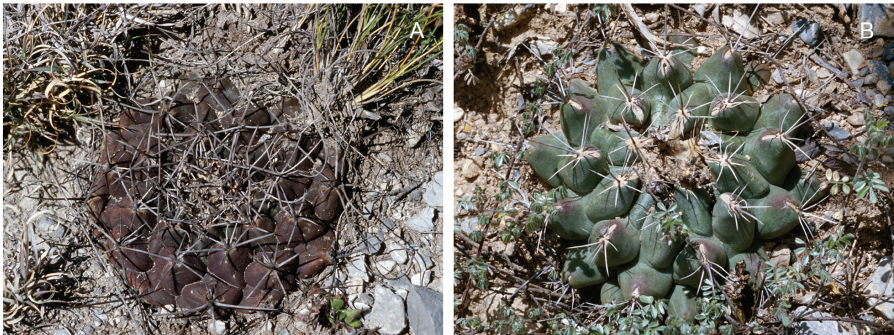
Figure 1. Thelocactus buekii in Nuevo León, Mexico. A), Thelocactus buekii photographed in March, during the dry season, showing a dark reddish stem due to accumulation of betacyanins. B), Thelocactus buekii photographed at the end of the rainy season, in September. The stem is green with only tubercle tips showing a reddish colour.