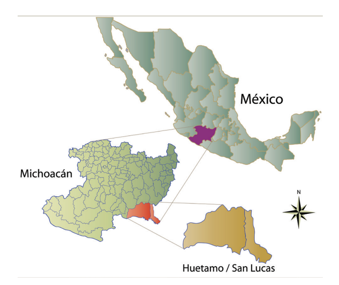
Figure 1. Location of the study region in the Balsas River Basin, States of Michoacán and Guerrero, México, were Llaveia axin axin has been reported. The insect was only found in 3 localities in the Municipalities of Huetamo (Arroyo Hondo, N=2) and San Lucas (San Pedrito, N=1).

Sampling design. In September 2006, based on topographic and vegetation maps of the Balsas River Basin in the South-West region of the state of Michoacán and the North of the state of Guerrero the sites were "aje" populations have been reported were located (Fig. 1). Fifteen localities were found and visited; 13 in the state of Michoacán (Rancho Tomatlán, Tziritzícuaro, San Lucas, El Coco, Rancho el Tecolote, Arroyo Hondo, San Jerónimo, Cuahutémoc, Pinzán Colorado, El Limón, La Cuchilla, and Monte Grande), and 2 in the State of Guerrero (Cutzamala and Zirándaro). In each locality, 3 km trails were walked looking for the incidence of the "aje". Once found, the geographic position of the populations was obtained with a GPS (Garmin 12 XL, Olathe, KS, USA). To verify the presence of "aje" populations, each of the 15 sites was visited 4 times throughout 2006 and 2007. In October 2006, only 2 populations in Arroyo Hondo (Municipality of Huetamo) were found. These populations are thereafter referred to as Arroyo Hondo 1 and Arroyo Hondo 2 (Fig. 1). In November 2006, a third population in San Pedrito (Municipality of San Lucas) was found. All populations were located in Michoacán (Fig. 1). No other populations were found in the remaining localities. Between the years of 1976 and 2000, the Municipalities of Huetamo and San Lucas lost ca. 30 140.4 ha of tropical dry forest at a rate of 1 255.8 ha/yr (C. Pacheco, pers. inf.).