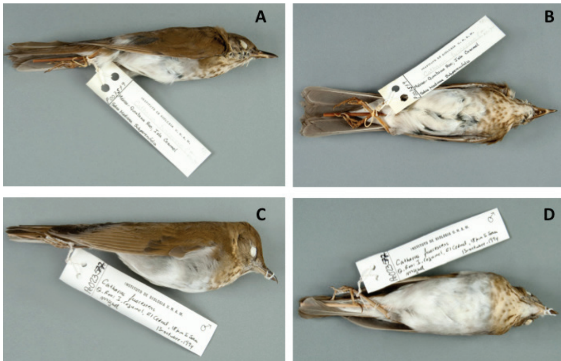
Figura 3. Catharus fuscescens . Specimen 1: A), ventral view; B), right side view. Specimen 2: C), ventral view; D), right side view.