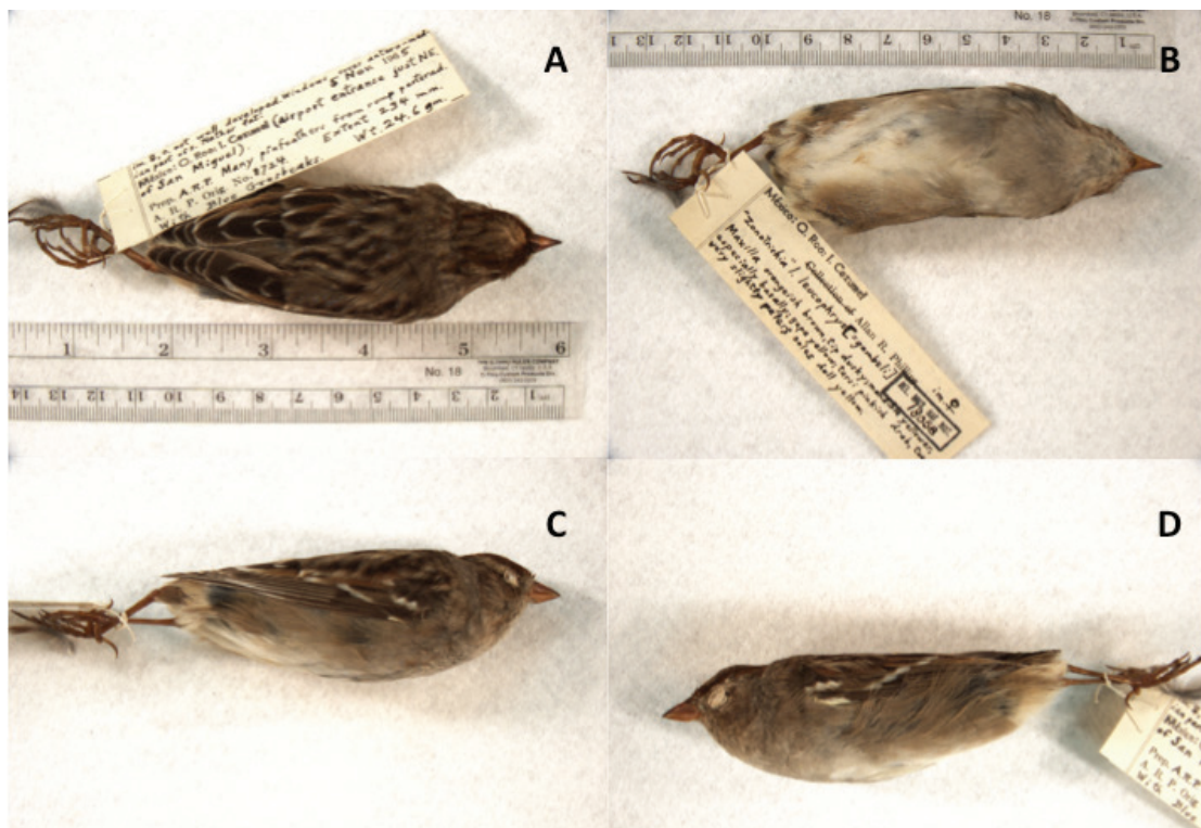
Figura 4. Zonotrichia leucophrys . A), dorsal view; B), ventral view; C), right side view; D), left side view.