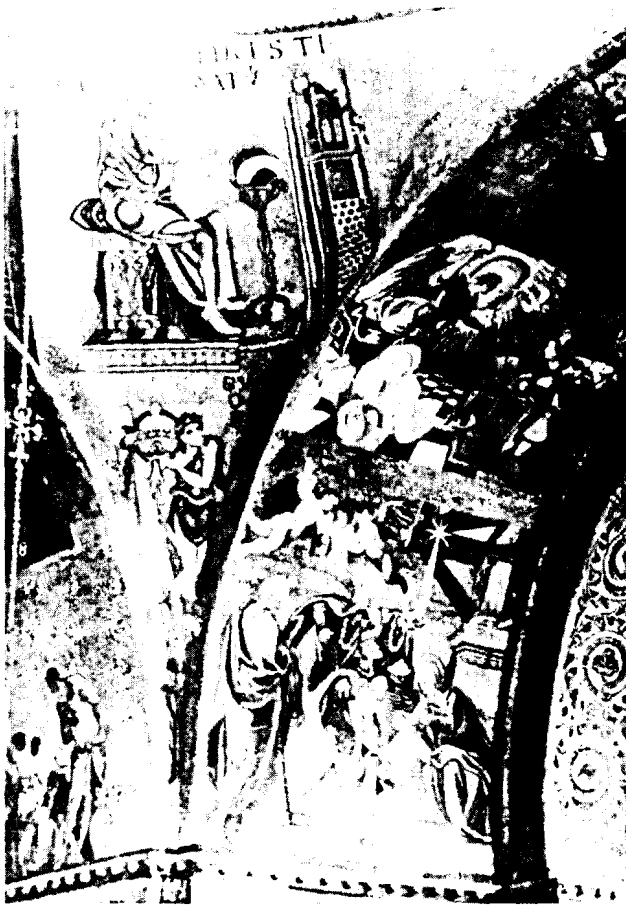
Figure 4.1 One of the four spandrels of St. Mark's. seated evangelist above, personification of river below.

ivers (Tigris, Euphrates, Indus, and Nile) pours water from a pitcher in the narrowing space below his feet.