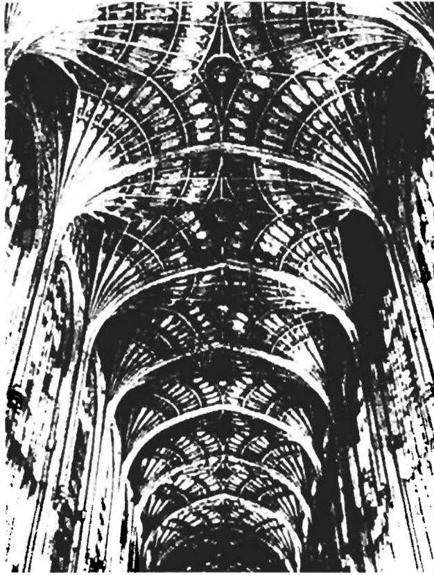
Figure 4.2 The ceiling of King's College Chapel.

The spaces arise as a necessary by-product of fan vaulting; their appropriate use is a secondary effect. Anyone who tried to argue that the structure exists because the alternation of rose and portcullis makes so much sense in a Tudor chapel would be inviting the same ridicule that Voltaire heaped on Dr. Pangloss: "Things cannot be other than they are.... Everything is made for the best purpose. Our noses were made to carry spectacles, so we have spectacles. Legs were clearly intended for breeches, and we wear them." Yet evolutionary biologists, in their tendency to focus exclusively on immediate adaptation to local conditions, do tend to ignore architectural constraints and perform just such an inversion of explanation.